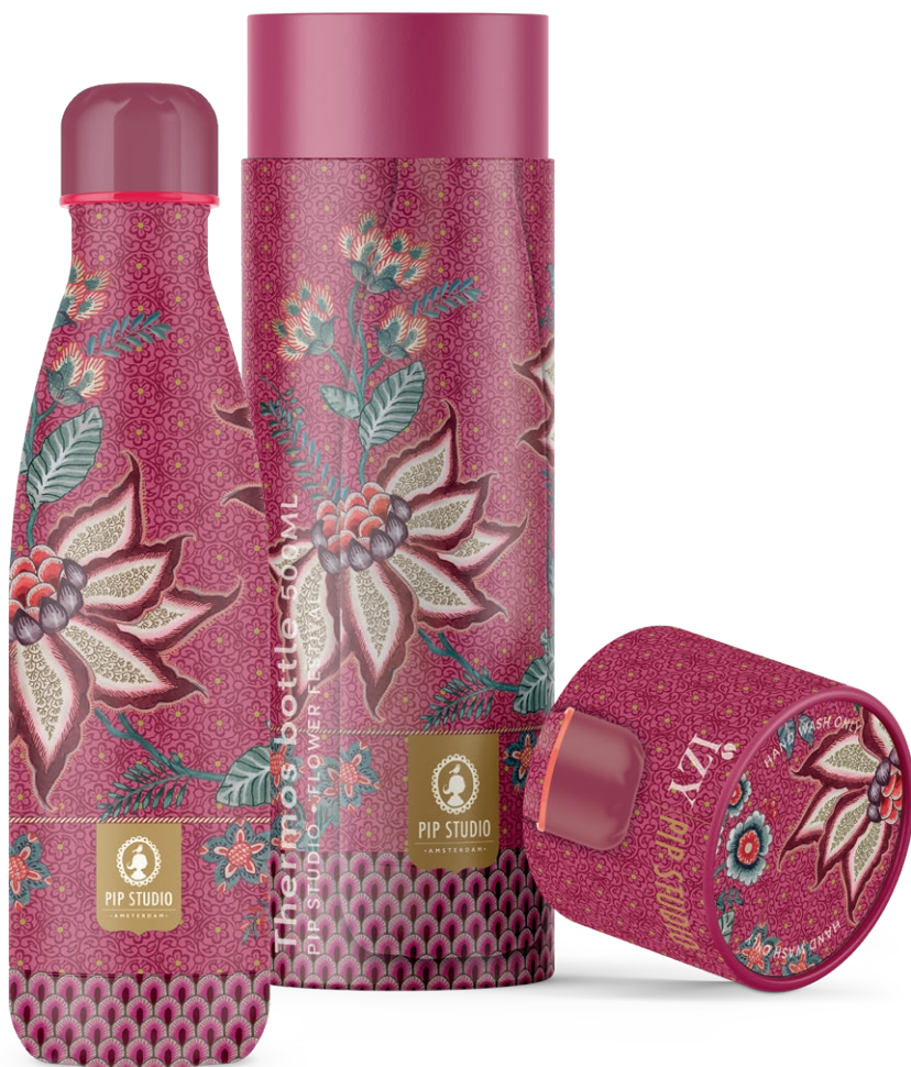
Thermos bottle - Flower Festival 500ml

This thermos bottle has the most beautiful flowers combined with refined Seigaiha waves that are typical Japan.