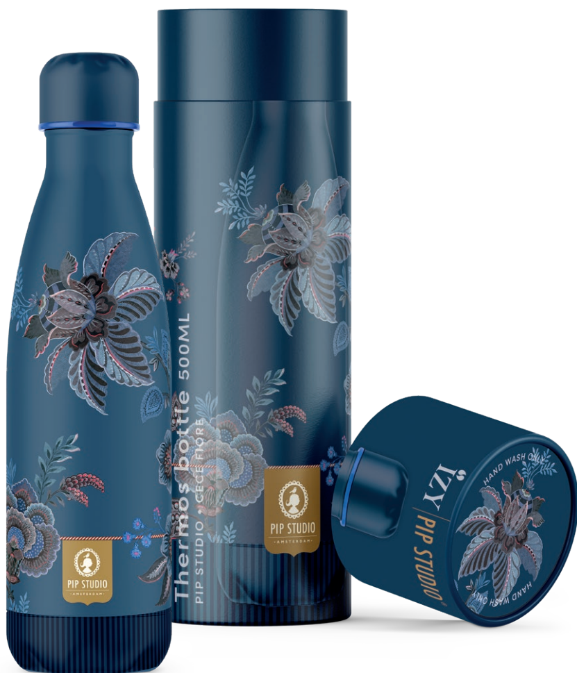
Thermos bottle - Cece Fiore 500ml

This thermos bottle is decorated with rich fantasy flowers on a beautiful dark background.